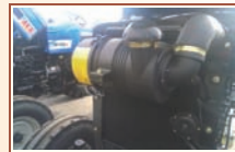
Dry Type Air Cleaner