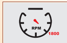
1800 R.P.M. - Max. Torque Reduce Engine Attrition