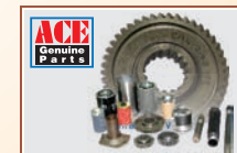
ACE Cost effective Genuine Parts