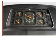
Attractive Meter Console