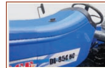
Fuel Tank - 55 Liter