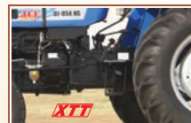
Heavy Duty XTT Transmission