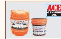
ACE Cost Effective Genuine Oil